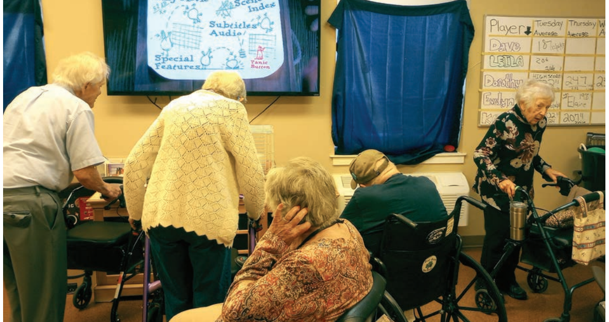
Our hatch the chicken program was a big hit. All of our residents came to the activity room to cheer on the hatch.