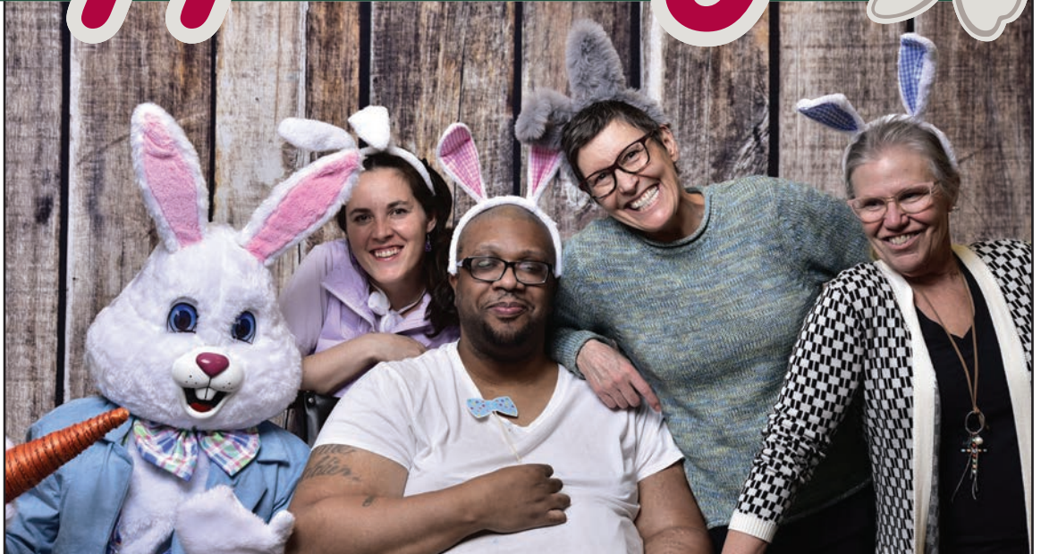
The weekend Activities staff pose with D and the Easter Bunny.